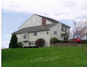
1 Whales View Drive $1,125,000