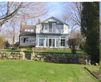
41 Avondale Road $2,850,000