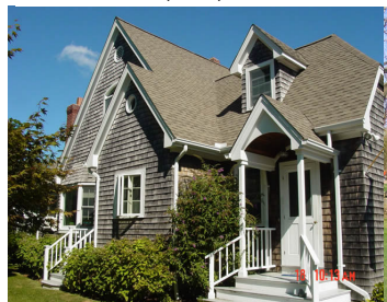
18 Shore Road $750,000