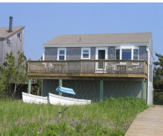
479 Atlantic Avenue $1,950,000