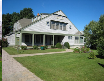
5 Ice Pond Road $1,150,000