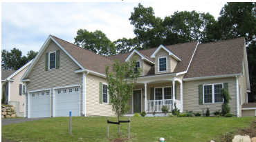
BUTTERFLY DRIVE (OFF EAST AVENUE) WESTERLY, RI

Are you ready to downsize? Come visit us at Butterfly Estates