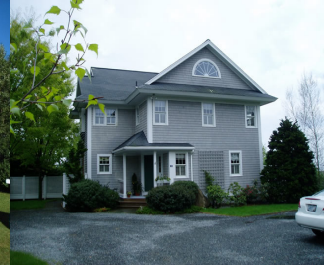
5 Upland Road $2,700,000