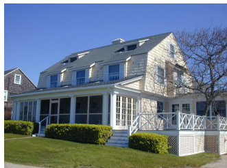
16 Waters Edge Rd $4,400,000